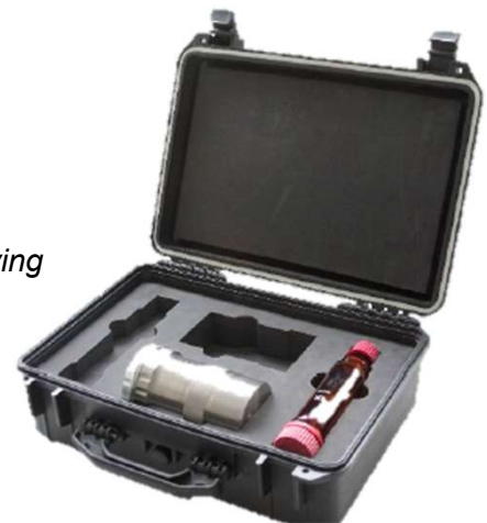
Sampling support carrying case