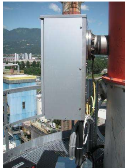
Sampling unit installation